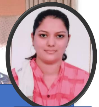
Vishva Solanki Arts Faculty